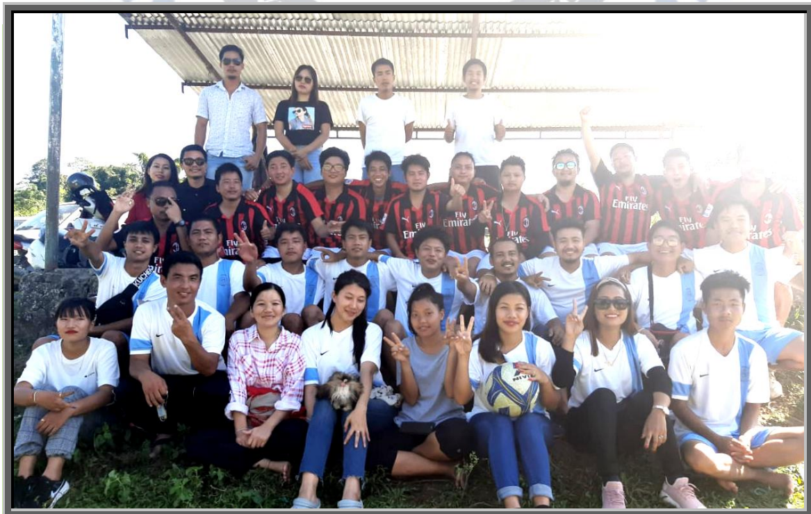
Intra-class football tournament organised by the students.

The college campus is equipped with sufficient facilities for outdoor sports and games, including opportunities to host intra-class tournaments. Students are motivated to take part in competitions organized by other colleges across the state. The campus features amenities such as a volleyball ground, badminton court, and basketball court.