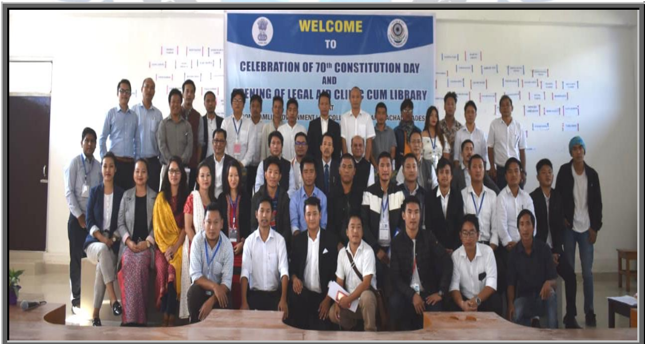
70 th Constitutional Day was celebrated at JGGLC, Jote. The programme was organized by the Arunachal Pradesh State Legal Services Authority.