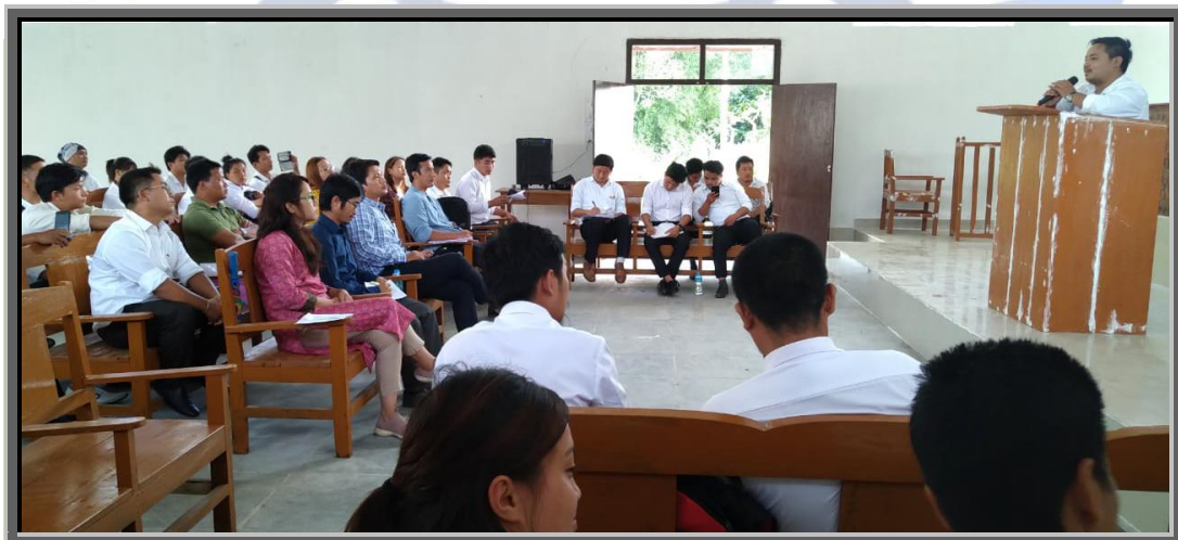
Debate Competition on the topic “Citizenship Amendment Bill”.

The Centre for Legal Studies and Research (CLSR) at JGGLC, Jote organizes weekly events focused on discussions and debates regarding current issues. These events serve as a platform for enhancing knowledge, fostering discussion, and building capacity. Students participate actively in these activities each week, and participation is rewarded with certification.