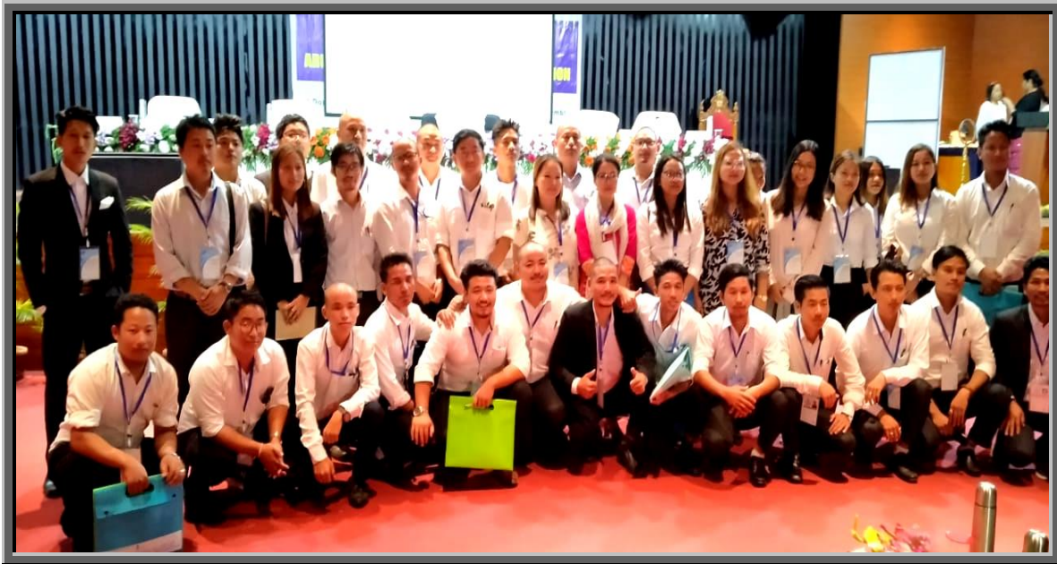
Faculties and Students participated in the State Convention on the RTI Act 2005 and the 13th Foundation Day of the Arunachal Pradesh Information Commission, held at the Convention Hall of the State Legislative Assembly, organized by the RTI Commission..