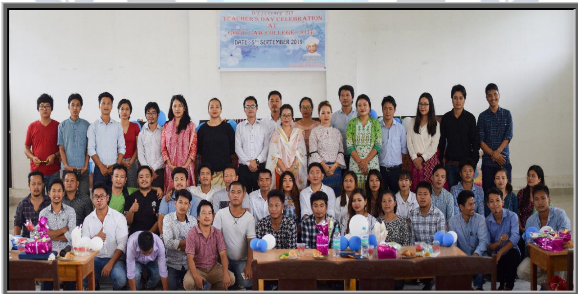
Teacher's Day was celebrated at JGGLC, Jote. Students actively organized the event to honor and acknowledge the role of teachers in their lives. They emphasized the dedication and sacrifices of teachers in nation-building and shaping invaluable citizens.