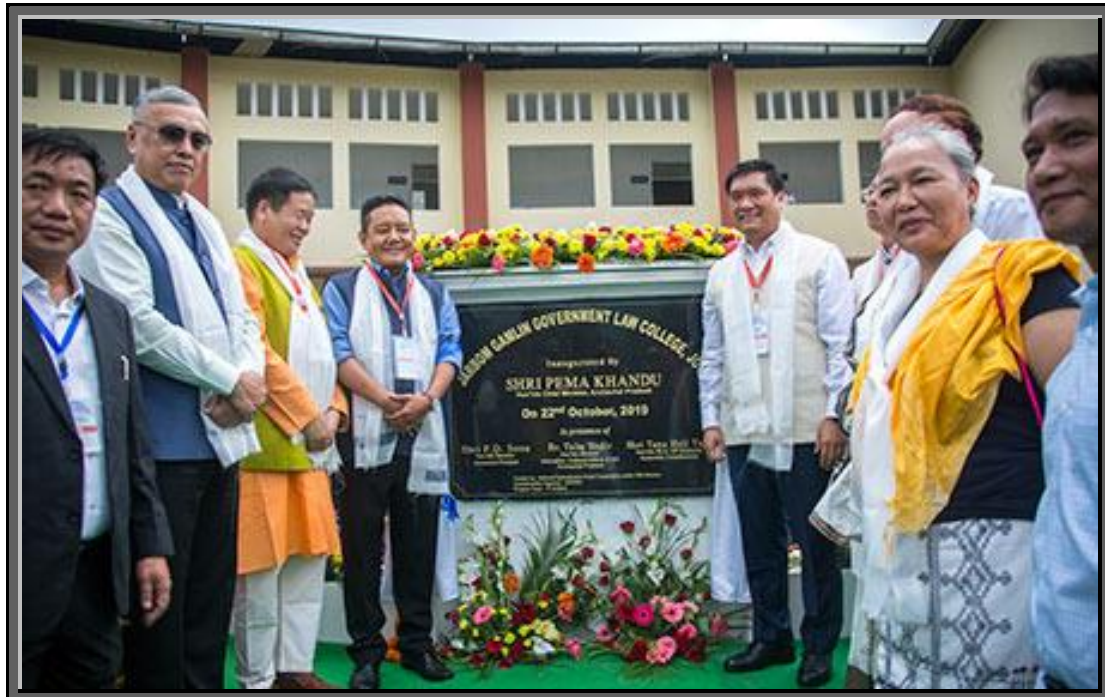
Jarbom Gamlin Government Law College, Jote was inaugurated by Shri Pema Khandu, Hon'ble Chief Minister of Arunachal Pradesh.