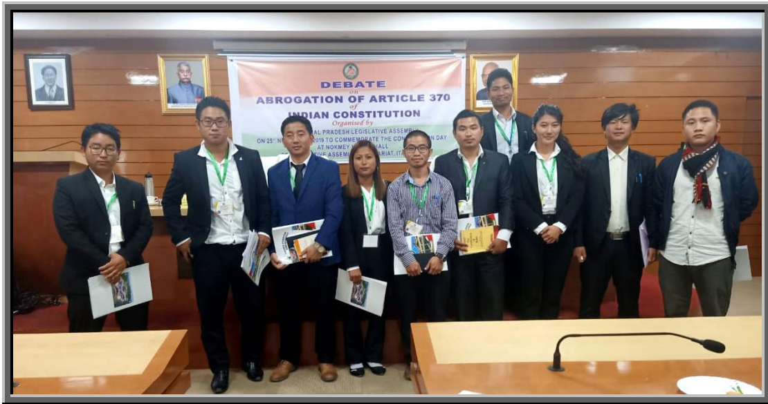
Represented Jarbom Gamlin Govt. Law College, Jote, in Debate Competition on “Abrogation of Article 370”, organized by Arunachal Pradesh Legislative Assembly.